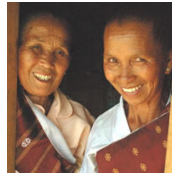
Lao Phuan Laos

The Lao people are renowned for being gentle, friendly and peace-loving. Their communities revolve around close-knit family ties. They have a high birth rate, perhaps because of how they value families. The ancestors of these people are believed to have migrated southward from China approximately 1,000 years ago. Not wanting to acknowledge the reality of sin and the need for forgiveness of sin is sometimes an obstacle to accepting the Gospel message. Pray the Lao believers will grow strong in numbers and maturity, that they become able to effectively carry the Gospel message to their own people.