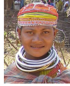
Bondo Poraja India

The Bondo religion is a mixture of their traditional faith and Hinduism. Patkhanda Mahaprobhu is their supreme deity. The Bondo have started worshipping many Hindu deities like Rameshwar, Durga, Brahma and Maheshwara. The Bondo have a very low literacy rate. The Gospel message needs to be made available in oral form. Pray for the Bondo community to be delivered from the false gods of this age. Pray for the few Christian believers among the Bondo, that they will fellowship together, being united around the truth found in Jesus Christ.